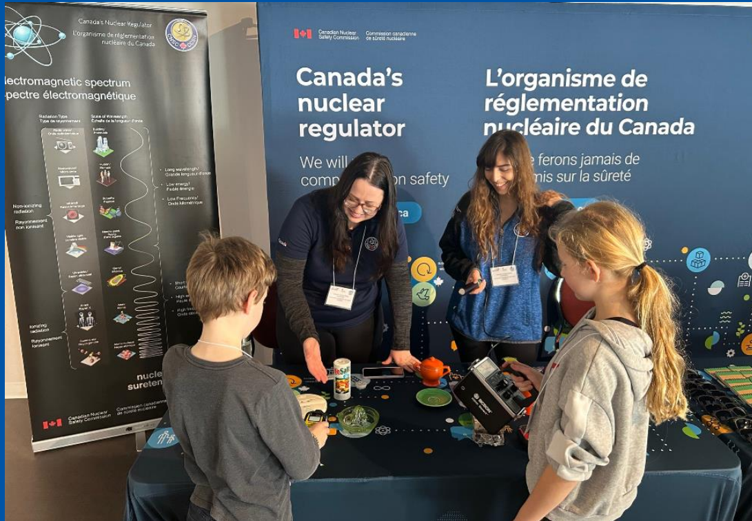
Pictured: CNSC Experts with my adorable children